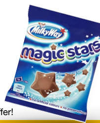
Examples of Prizes on Offer!