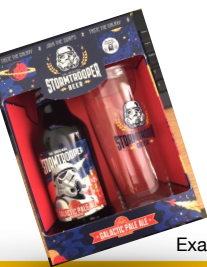
Examples of Prizes on Offer!

Send in your entries to the WhatsApp group!